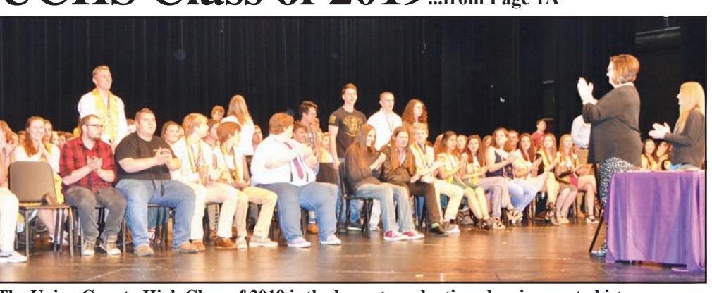
The Union County High Class of 2019 is the largest graduating class in county history.

and I know that everyone is going to go out and do some amazing things. So, it's been an honor to share these past four years in the school with them."